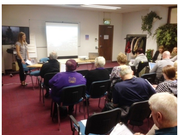
Consultation event held in Craigavon

Throughout April 2016, the Housing Executive and the Department for Communities SHRP Team, with the assistance of Supporting Communities, facilitated a number of successful engagement sessions regarding the outcomes, recommendations and actions of the recent Housing Executive stock condition survey with the Housing Executive's Scrutiny Panel members.