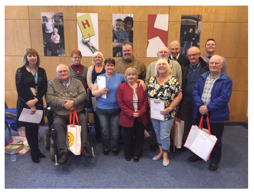
Tenant Representatives at Helm Housing Tenant Engagement Workshops

From the beginning of this process we believed that we needed to avoid the perception that we were simply going through the motions in engaging with tenants and at the end of the process, in familiar "Blue Peter" tradition, simply pull out one that we had prepared before. We recognised that we needed independent expertise to not only