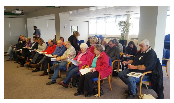
Ballymena Consultation Event

The sessions allowed for interactive engagement and Area Scrutiny Panel Members challenged the Housing Executive and Department for Communities on areas such as New Build Programme, property design, how the Housing Executive were going to save money, as well as concerns regarding the allocations system.